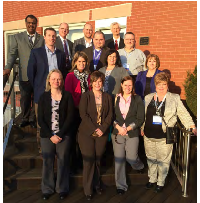
ORNL FCU (TN) staff enjoy the Rooftop Terrace.